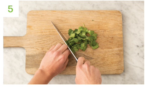
Prep the garnish

Return the frying pan to a medium-high heat with a drizzle of olive oil . Cook the capsicum , corn and onion , tossing, until softened and browned, 5-6 minutes . Season with salt and pepper .