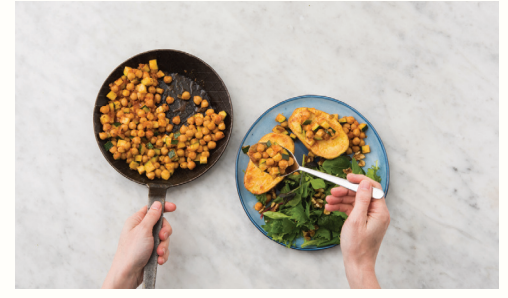
SERVE UP Divide the quick jacket potatoes between plates and top with the spiced chickpeas and a dollop of Greek yoghurt . Serve the salad on the side.

*TIP: Dress the salad just before serving to avoid soggy leaves.